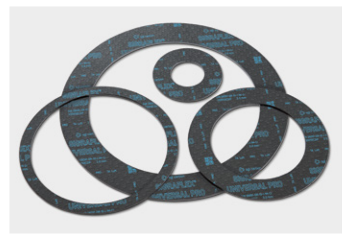
↑ Gaskets made from SIGRAFLEX UNIVERSAL PRO