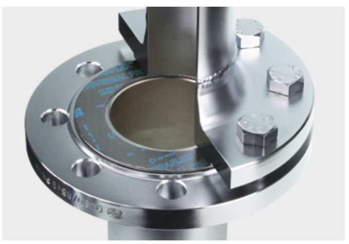
↑ Flange with SIGRAFLEX UNIVERSAL PRO gasket