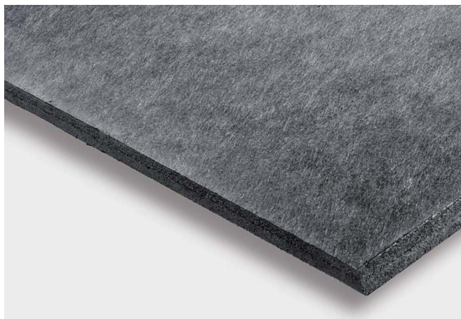
↑ SIGRATHERM LN lightweight laminated graphite board

Other dimensions and combinations on request. Please contact us.