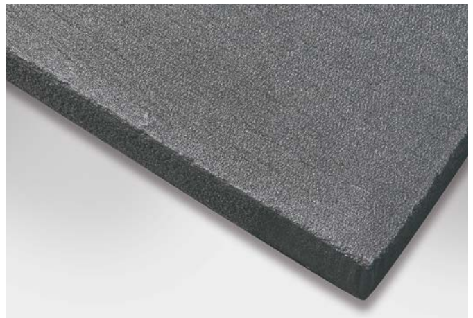
↑ SIGRATHERM L lightweight graphite board

A wide range of electronic cooling applications as well as power devices benefit from SIGRATHERM's excellent material properties, as well as applications in the field of electrical conductivity enhancement.