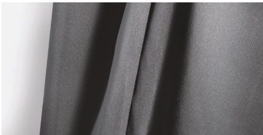
↑ Fabrics made of stretch-broken yarn exhibit an excellent drapability

Carbon fiber fabrics made of stretch-broken yarn exhibit a high porosity/permeability and good conductivity in combination with an excellent drapability and high tensile strength. These properties make them suitable as an electrode material for many applications, e. g. in the field of electrolysis, [microbial] fuel cells, electrochemical sensors or as catalyst carriers. By varying the fabrication parameters, i. e. the used yarn, the weaving parameters, or applying post-treatments, the fabrics can be adjusted to the requirements of the specific application.