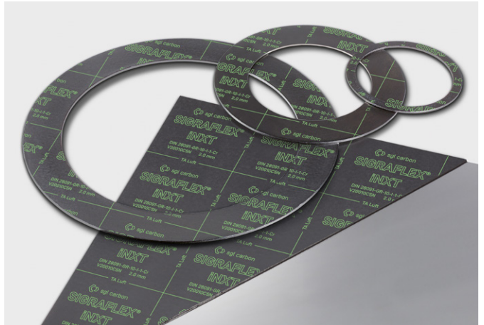
↑ SIGRAFLEX iNXT gasket sheet and gaskets