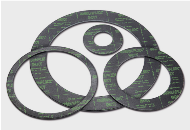
↑ Gaskets made from SIGRAFLEX iNXT