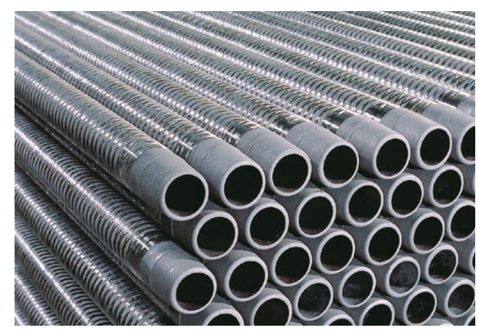
\uparrow DIABON graphite tubes equipped with CARBOGUARD

CARBOGUARD increases the operational reliability of DIABON® graphite and other materials [e.g. SiC tubes] enabling higher efficiency and throughput. It extends the range of application under high-stress conditions like temperature or pressure shocks. CARBOGUARD is mainly used for tube sheets, headers, column sections and especially for tubes.