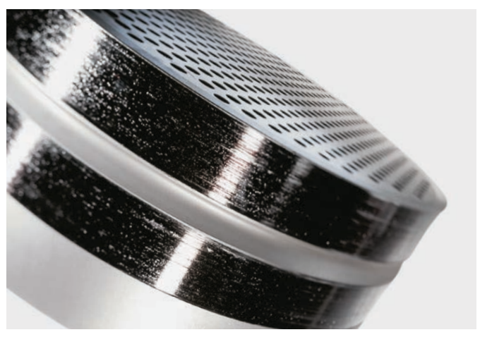
↑ DIABON graphite tubesheet with CARBOGUARD