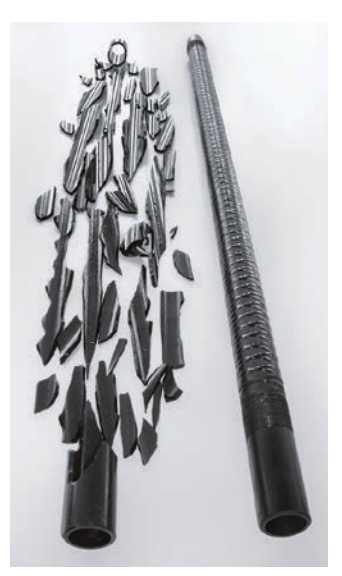
↑ Breaking behaviour of a silicon carbide tube without (left) and with CARBOGUARD (right)