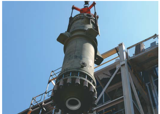
↑ Dismounting of a shell and tube heat exchanger

SGL Carbon's End of Life (EoL) service offers our customers individual and customized solution. It is based on our many years of experience as a manufacturer of equipment and systems with our detailed material knowledge.