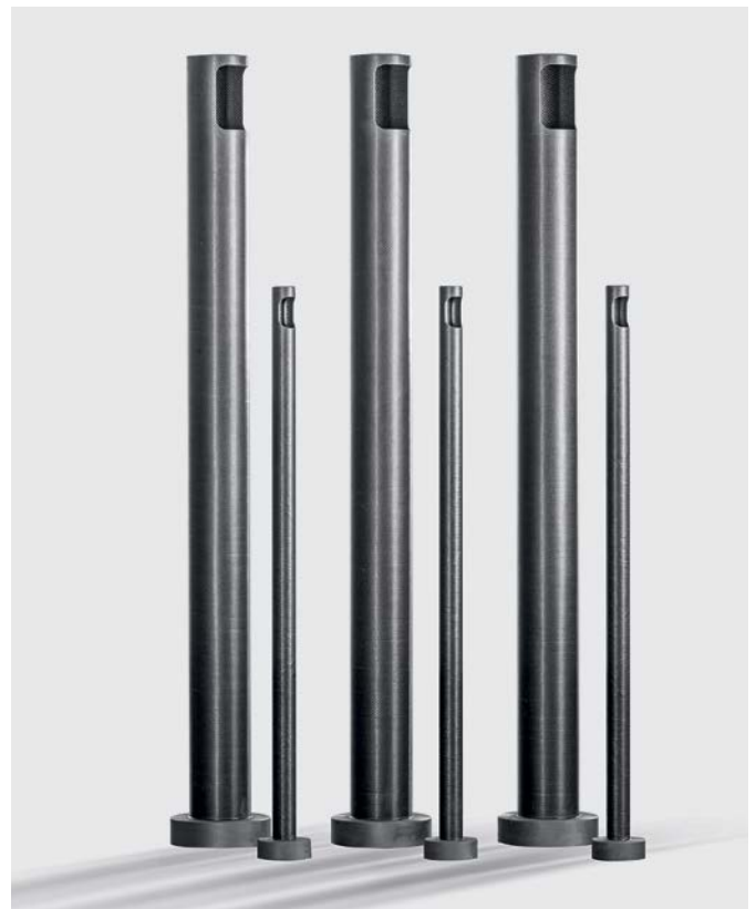
↑ Feed tubes DN150 x 2080 mm and DN50 x 1470 mm