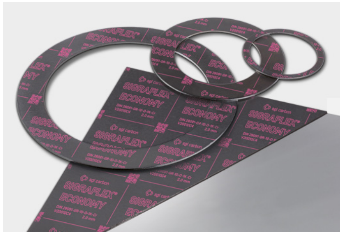
↑ SIGRAFLEX ECONOMY sealing sheets and gaskets