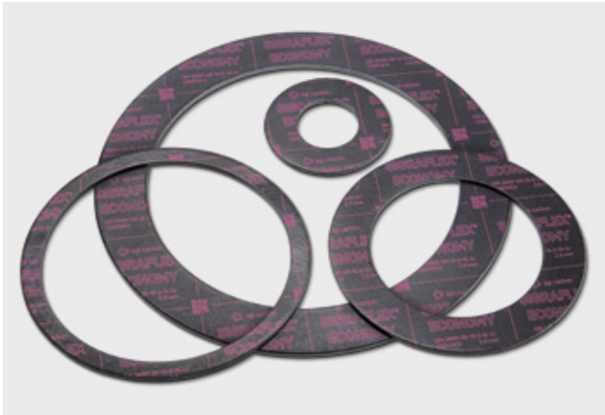
↑ Gaskets made from SIGRAFLEX ECONOMY