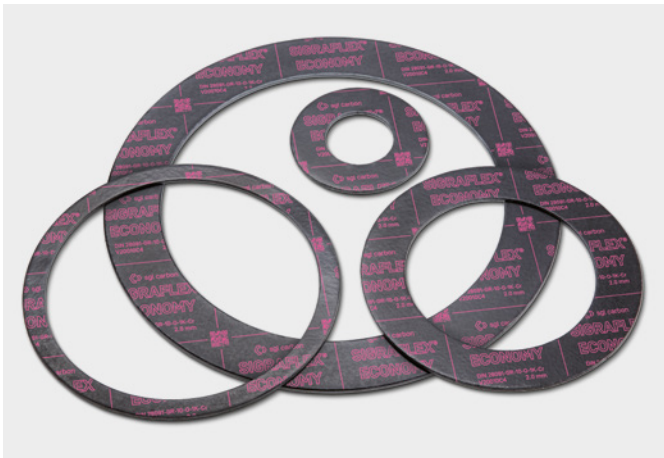
↑ Gaskets made from SIGRAFLEX ECONOMY