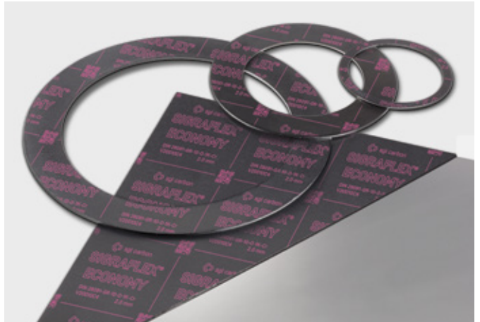
↑ SIGRAFLEX ECONOMY sealing sheets and gaskets