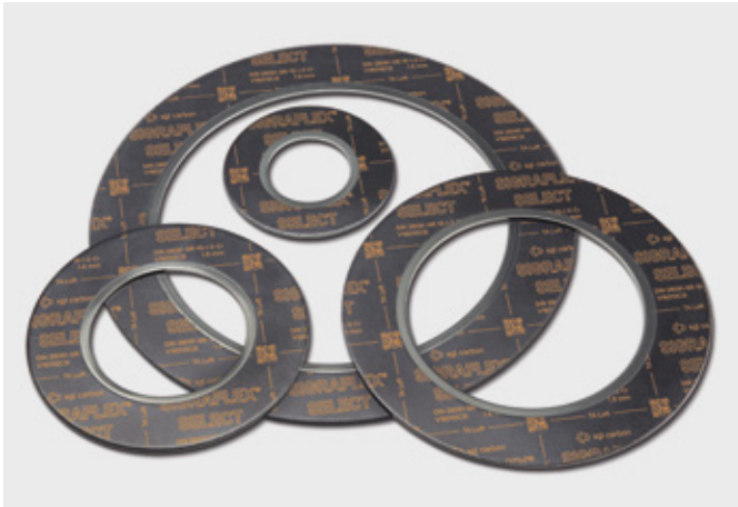
↑ Gaskets made from SIGRAFLEX SELECT