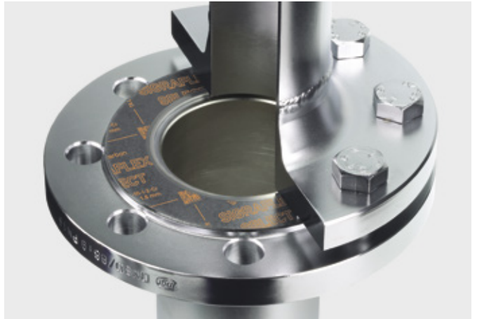
↑ Flange with SIGRAFLEX SELECT gasket