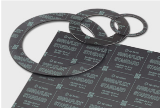
↑ SIGRAFLEX STANDARD sealing sheets and gaskets