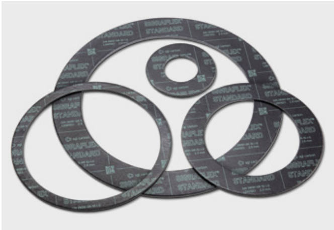
↑ Gaskets made from SIGRAFLEX STANDARD