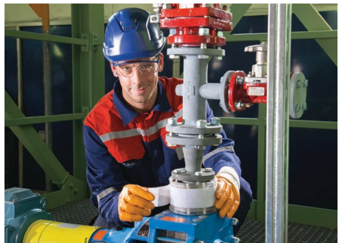
↑ Assembly of the safety tape flange connection