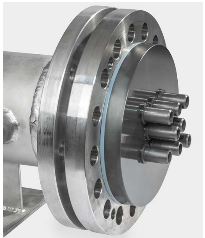
↑ Sicabon shell and tube-HX with SiC intermediate plate and SiC-tubes

By applying a temperature stable and corrosion resistant intermediate plate made of SiC, the performance and tightness of our SICABON heat exchanger is assured. Even within harsh, cyclic applications this design has proven its outstanding capabilities for significantly increased service life: Zero leaks and no deformation of now ceramic based sealing surfaces is verified within substantial heating and cooling cycles on test bench and in field applications.